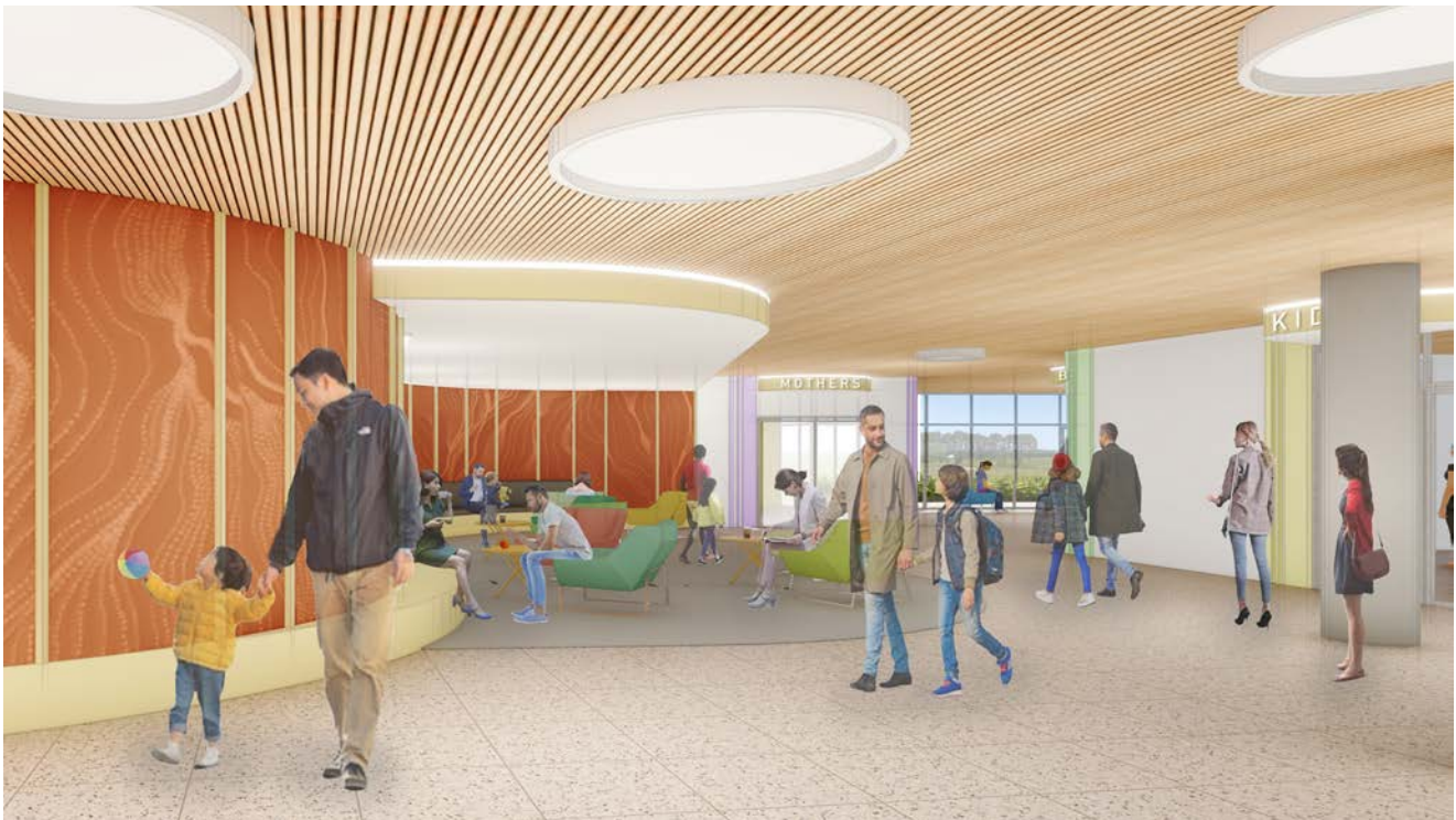
Maternity unit lobby, artist impression

Over 30 per cent of respondents felt that artwork would help make the hospital feel more welcoming. Overwhelmingly, people would like to see artwork created by local Gippsland artists. Artwork in the form of photographs and paintings were also popular.