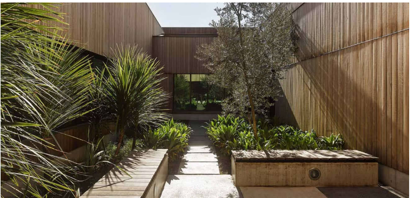
Inspirational landscaping photo rated the highest by survey respondents

When provided with some inspirational photos of what the design of the outdoor spaces could look like, the landscaping photo featuring greenery and earthy wood finishes rated the most popular.