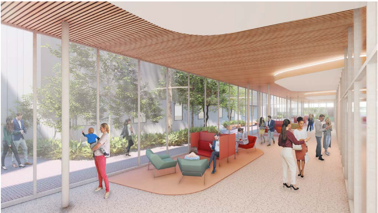
Medical imaging lobby, artist impression

As the project progresses, there will be more opportunities for the community to be involved in the project. For more information and to keepup to date on the project, visit www.vhhsba.vic.gov.au or www.lrh.com.au .